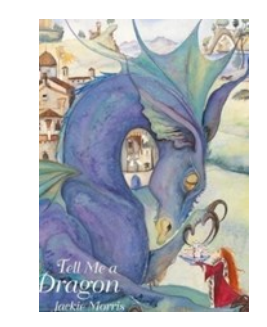
Tell me a dragon